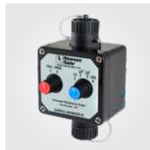
Universal Resistance Tester Product Code: URT.