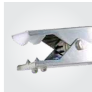
Tungsten Carbide Teeth