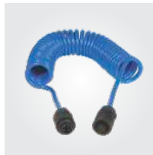
Cen-Stat cable supplied with male and female in-line Quick-Connects.

The spiral cable provides effective retractability when the clamp is not in use, ensuring the cable is neatly stowed and safely out of the way.