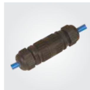
In-Line Quick Connect.

The Bond-Rite® EZ forms part of the Bond-Rite® range of Static Grounding and Bonding Equipment available from Newson Gale Ltd