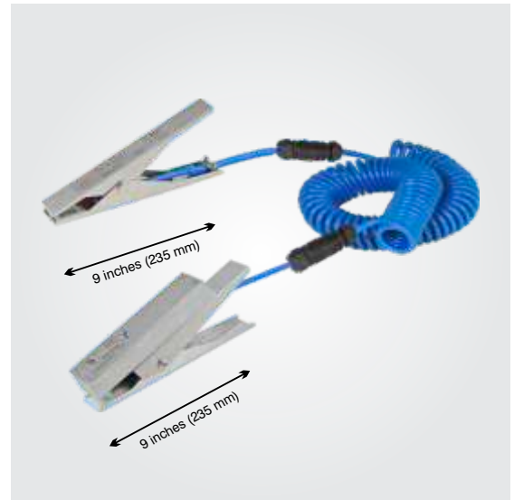
BREZ05 / IPX90 Bond-Rite EZ with X90IP large heavy duty clamp and 5 m (16 ft.) of Cen-Stat™ protected cable. Also available with X45IP standard size heavy duty clamp.